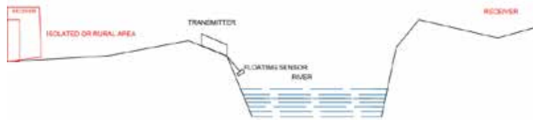
Fig 4: Flood alert system in isolated place (software Auto CAD)

This is a new method named as flood alert system in a simple way for location of isolated places and rural areas. It will be affected effectively; it can use local persons also.