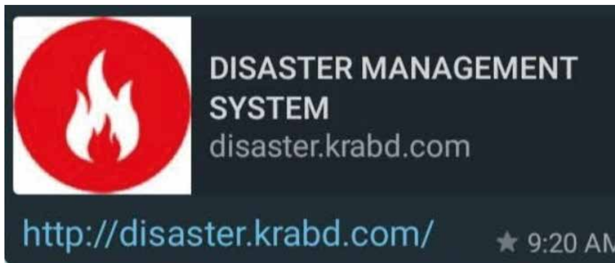
Fig 7: web site

The web page is another important part in flood alert system. This is available in authorities, who are helpful from flood, like as police station, fire rescue, district magistrate office etc. This method is handy for the speed up the evacuation procedures. The site is open by entering the “username” and “password”.