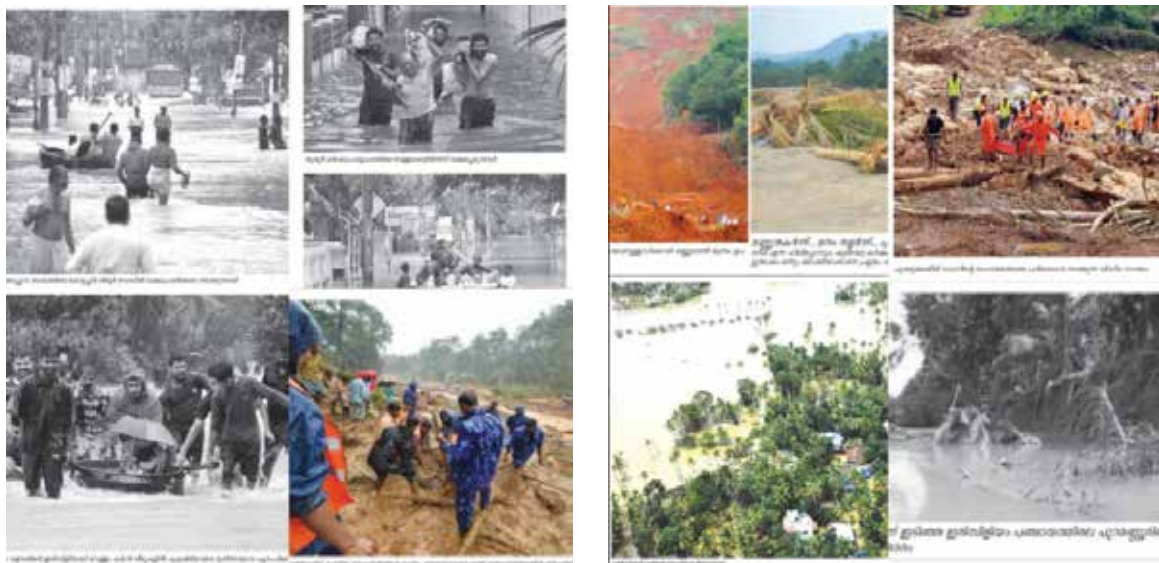
Fig 1: Floods in 2018 and 2019