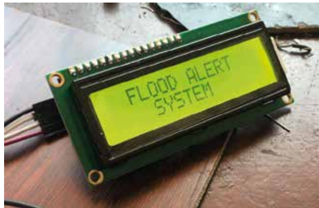
Fig 3: Flood alert system

The above systems are to be invented, but it has some drawbacks. Current flood alert systems are very large and the working is not easy for ordinary people. Flash floods are unpredictable. When the flash flood occurs all the transmitter and sensors that are placed near the river or reservoirs get swept away and that communication get lost too. So the existing flood alert systems are having so many demerits.