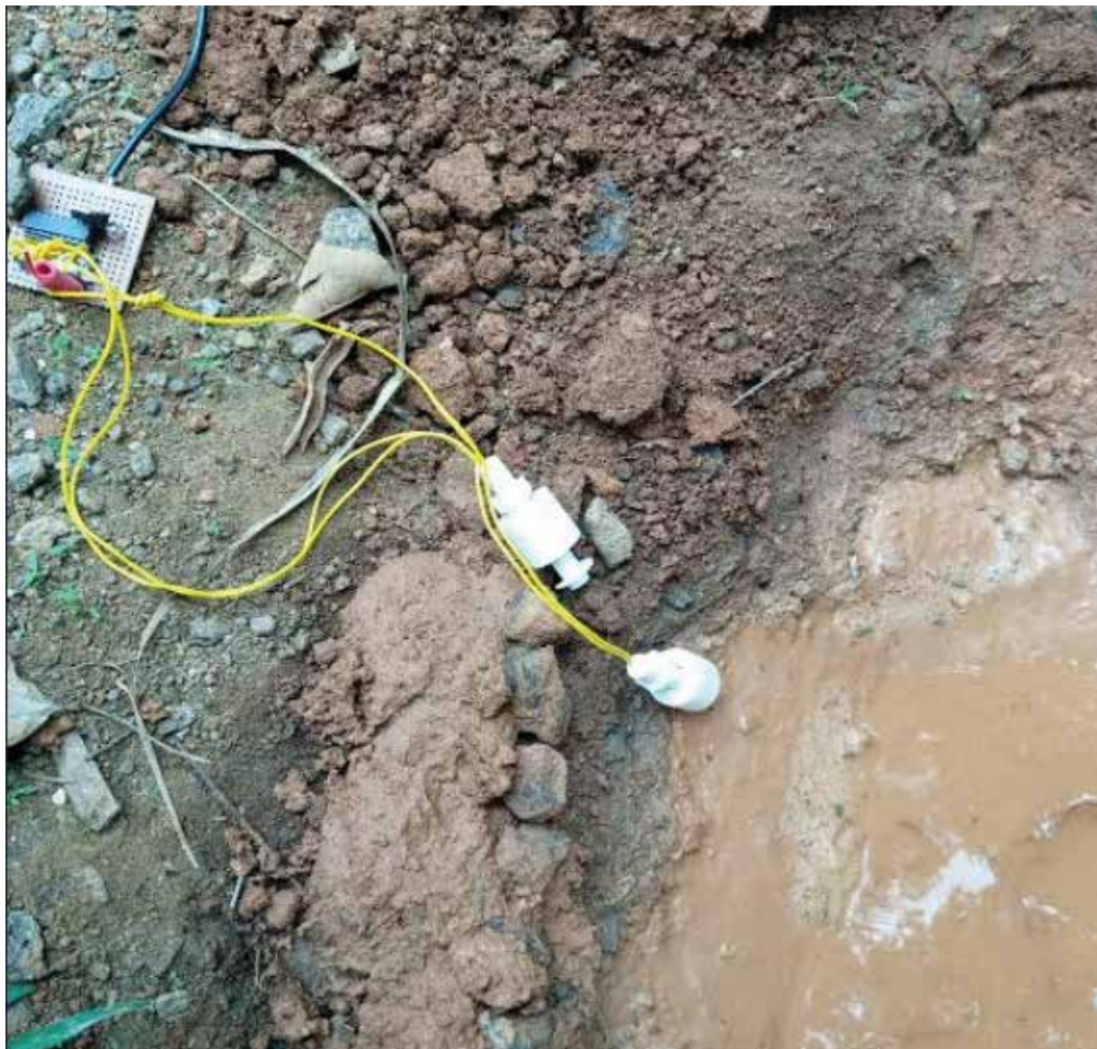
Fig 5: Transmitter

From the above figure we can see the transmitter located at the shore from the water body and the floating sensors are lying to the water. The first one is near the first limit of water second one is above from the first floating sensor. When the water rises above the limit the RF signals are passed this message from transmitter to receiver at that time. But the transmitter can resist the flash flood, it's flows away when it comes.