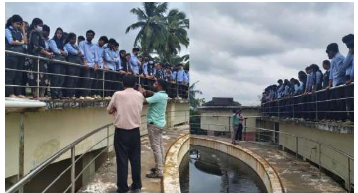
Industrial Visit to Water Treatment Plant, Malampuzha [22-08-2025]